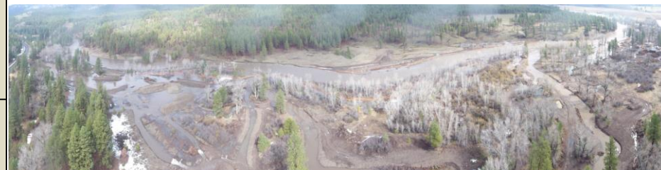
Drone panoramic view of central project area, April 2019