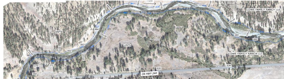
Bird Track Springs Before (2016) and After (December 2019)